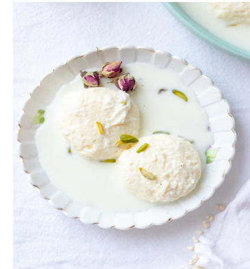
Ras Malai 6.99

Carrot based Indian sweet dish with a scoop of vanilla ice cream.