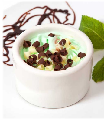
Midnight Mint 5.99

Creamy dessert made with pistachio kulfi ice cream, saffron, topped with almond & pistachio nuts.