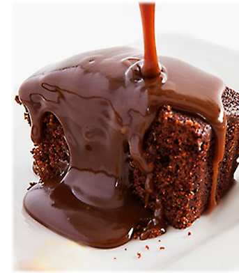
Chocolate Fudge Pudding 5.99

Luxurious dreamy Mint flavoured ice cream, rippled with gorgeous chocolate sauce, topped with curls.