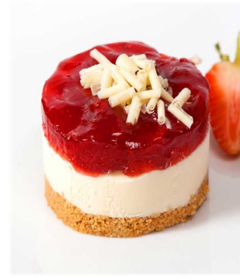
Strawberry Cheesecake 5.99

Elegant glass filled with dairy ice cream layered with thick chocolate sauce and Cadbury's Flake.