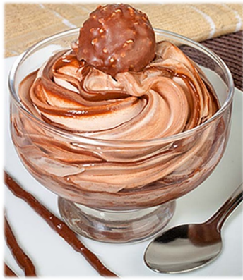
Ferrero Rocher 6.49

World famous rich Ferrero Rocher ice cream combined with thick chocolate sauce topped with Ferrero Rocher.