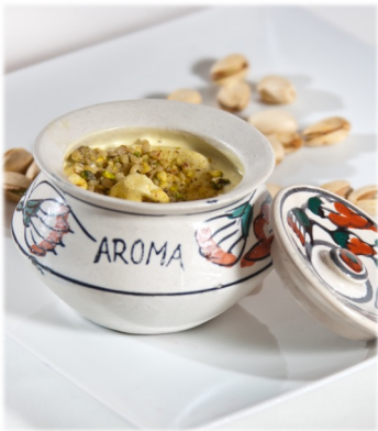
Matka Kulfi 5.99

A classic dessert. Layers of dark chocolate sponge, topped with a rich chocolate ganache.