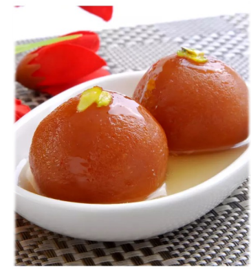
Gulab Jamun 4.99

A layer of moist chocolate cake forms over soft pudding, creating rich chocolate heaven. (Serve hot)