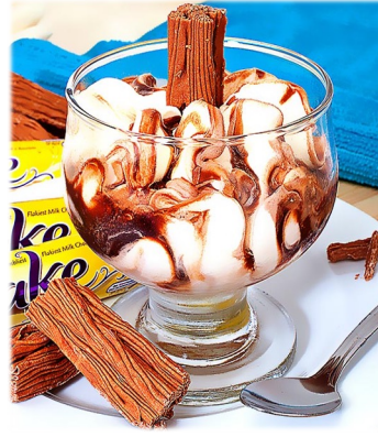
Cadbury Flake 6.49

World famous rich Ferrero Rocher ice cream combined with thick chocolate sauce topped with Ferrero Rocher.