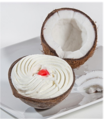
Coconut Supreme 5.99

Fried dough balls soaked in sugar syrup with a scoop of vanilla ice cream. (2pcs)