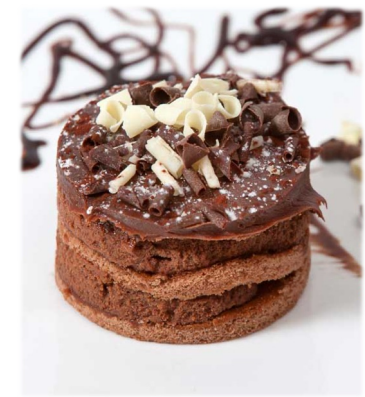
Chocolate Fudge Cake 5.99

Set on a biscuit base, made with cream cheese and a hint of vanilla. Then topped with a strawberry fruit topping.